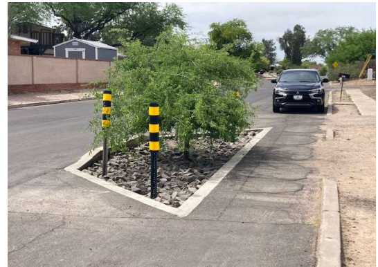
Potential chicane design

If you aren't signed up for the email group, you can subscribe by sending an email to: Miramonte-neighborhood-association+subscribe@googlegroups.com