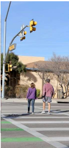
Enhanced street crossings

Significant improvements are planned for 5th Street and 6th Street between Alvernon and Campbell. Bond funding will provide for complete and connected sidewalks, safe crossings at major streets, street lighting, and landscaping for shade along the two-mile corridor. You can see the proposed plan at https://tucsondelivers.tucsonaz.gov/pages/5th6th