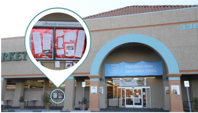
Neighborhood bulletin board located at Whole Foods